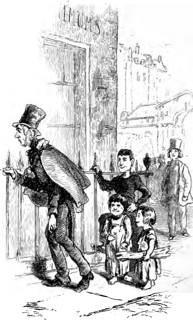
THE CAPTAIN WON'T GO HOME TILL MORNING